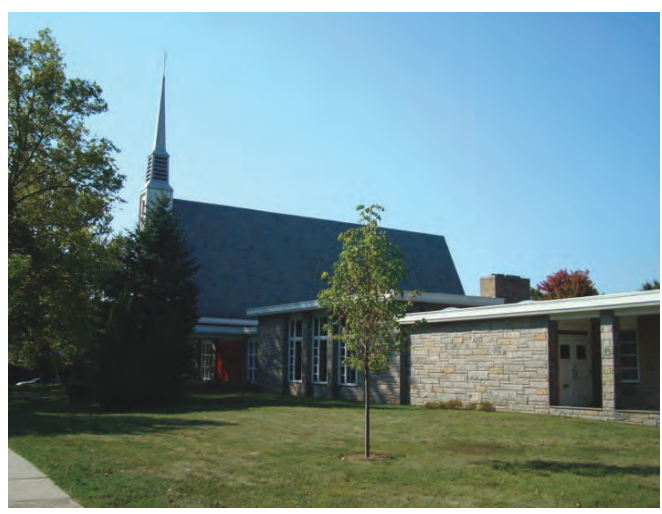
Seventeenth Sunday after Pentecost September 11, 2016 –10:30AM