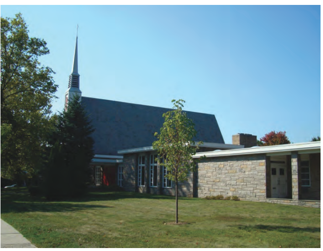
Seventh Sunday after Pentecost July 3, 2016 –10:30AM